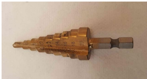
A Drill bit for making a large hole